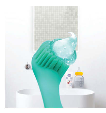
Press center button once for Brush Mode and press center button a 2<sup>nd</sup> time for Massage Mode.

We recommend using the following ISSA<sup>™</sup> mikro technique for 2 minutes for the most effective results: