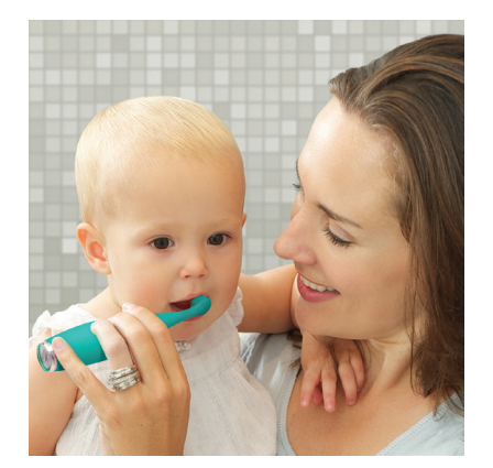
2. Use in the same way as a manual toothbrush, and brush teeth and massage gums with wide circular movements for 2 minutes. Press the center button a 3rd time to turn off device.

*Depending on your child's age, use with a dentist-recommended amount of infant-formulated soothing gel or toothpaste.